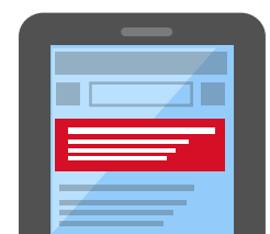
Ads on mobile