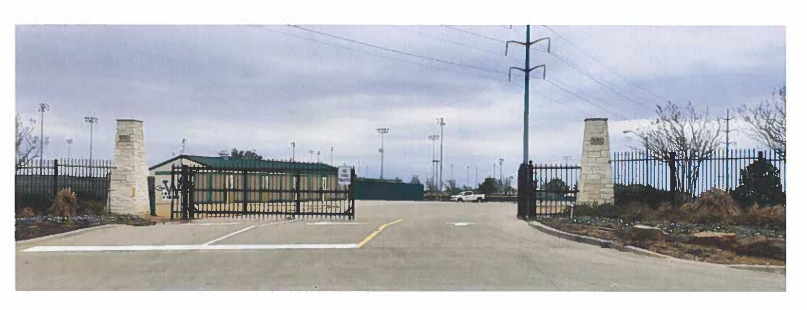
Rubber Track Resurfacing