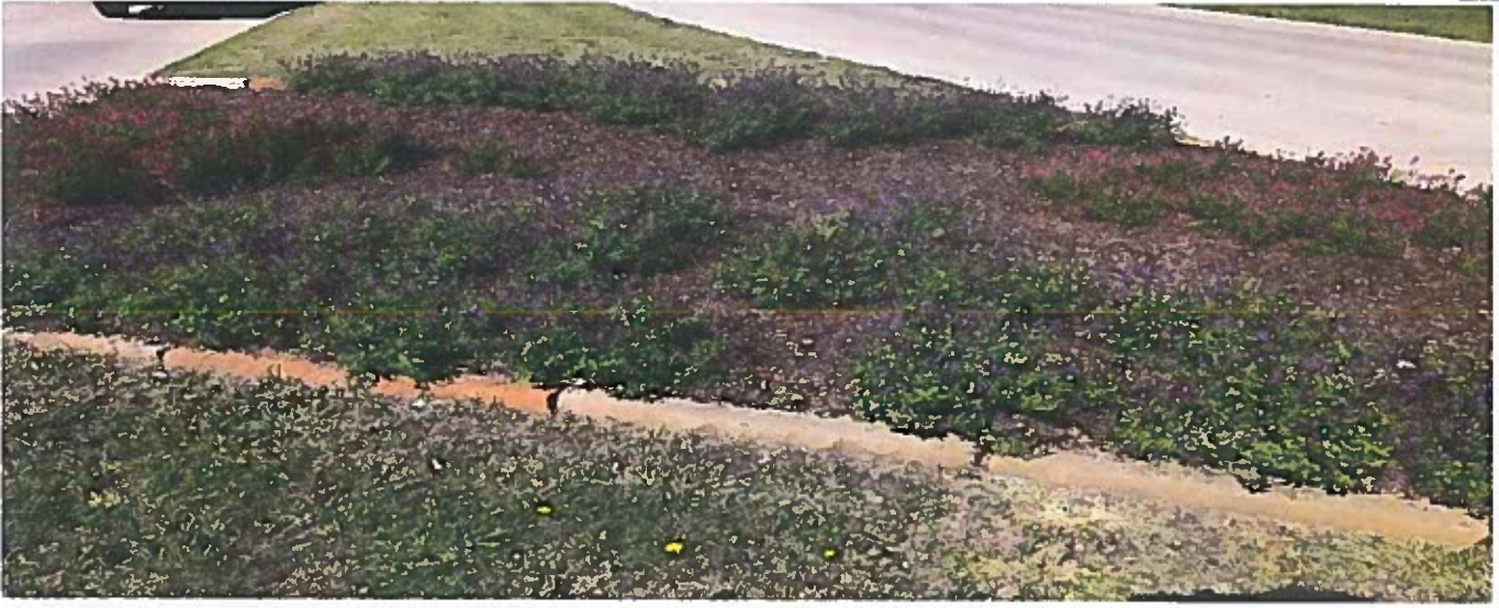
Broadhead Median 3 Install. Salvia geggii