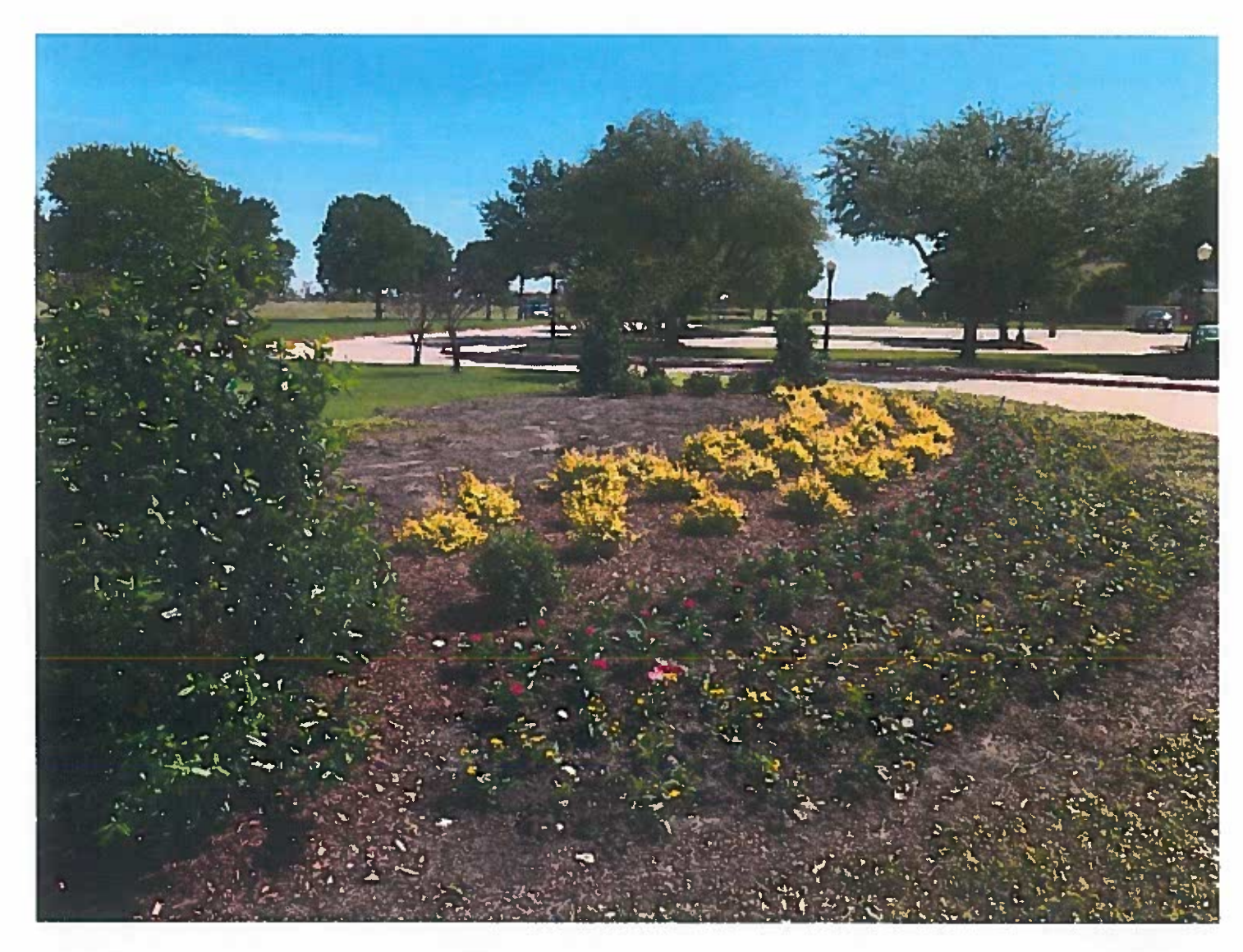
Civic Center Big Bed Shrub Install. Kaleidoscope Abelia (Center), Encore Azalea (Left & Right), Nelly R Stevens Holly (Ends)

Seasonal Color: Penta 'Lipstick Pink' and Lantana 'Lucky Pot of Gold'