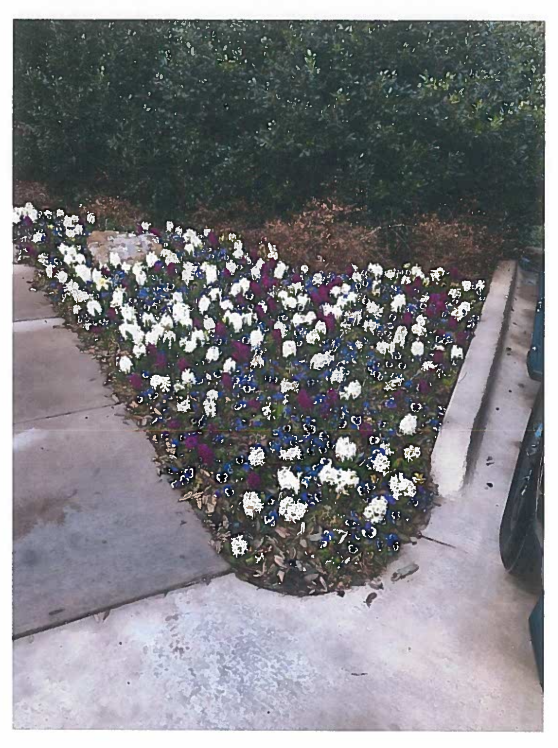
Exactly one week after the Big Freeze