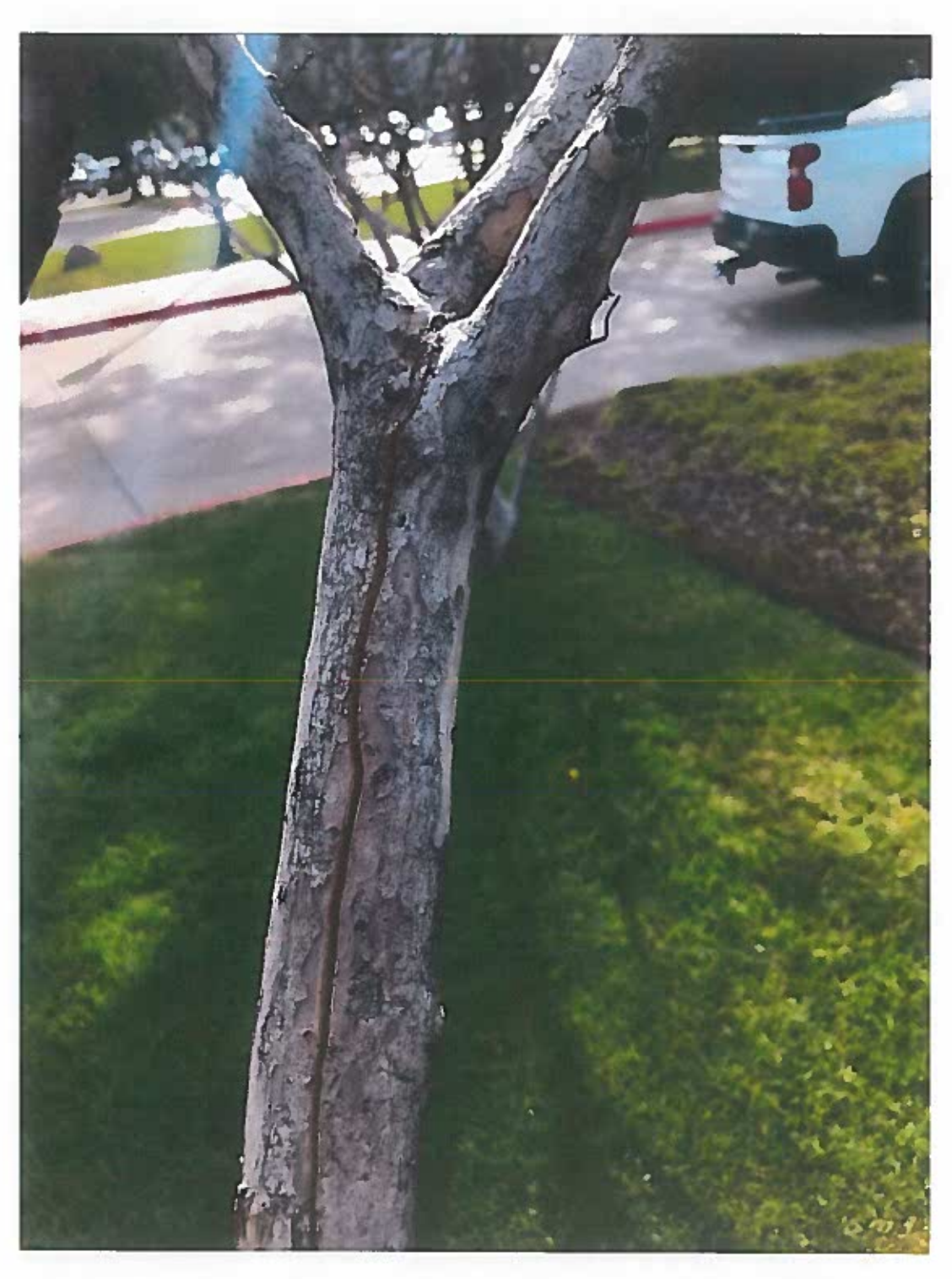
Cracked Trunks on Crape Myrtles at the Civic Center. A total of 3. Dead to the roots.