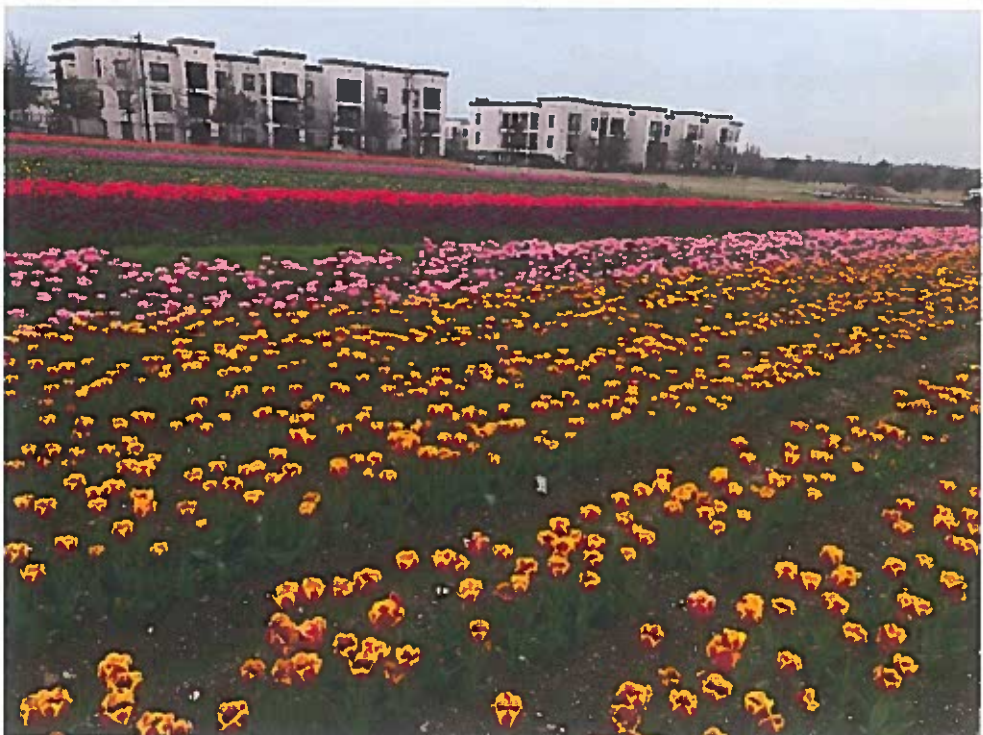
Tulip Photos Courtesy of Poston Gardens Facebook