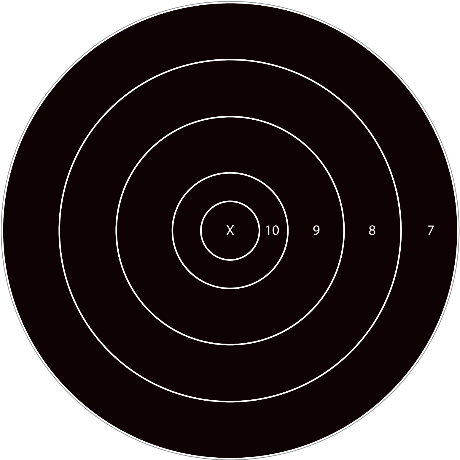
- Diagram #2 -