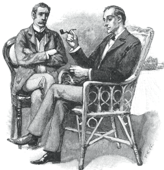
"HOLMES PULLED OUT HIS WATCH."

Despite "murder most foul" being at the center of most plots, true fans find the genre relaxing—nothing makes us forget our own troubles like a good whodunit.