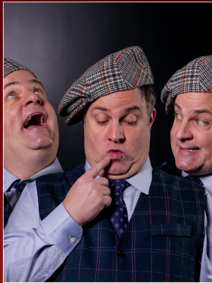
8 TIMMY, YONKERS, & SKID