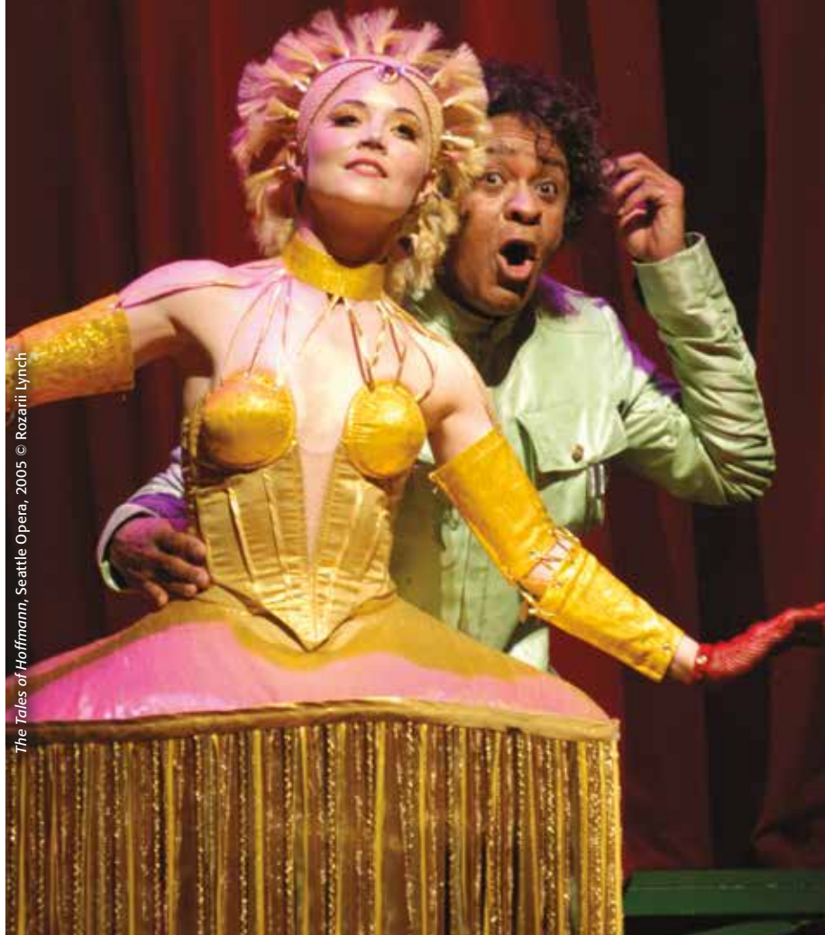
The Tales of Hoffmann, Seattle Opera, 2005 © Rozarii Lynch